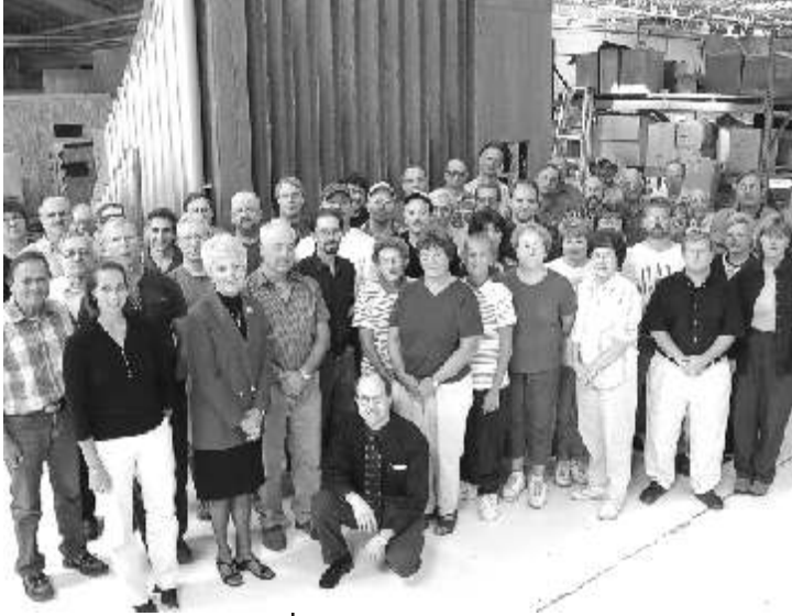
The Wicks Organ Company

The Wicks Organ Company of Highland, Illinois was incorporated in 1908, although our organbuilding history goes back earlier than that. The company has always been a custom builder, striving to create organs that are visually and tonally beautiful. Each instrument is designed specifically for the room in which it will be heard. Every organ is built by hand by over 60 trained craftsmen in 13 different trades. A pipe organ's success depends not only on its quality of construction, durability, and beauty of tone, but on being installed in an environment favorable to acoustic instruments and voices. To create an aesthetically pleasing environment suitable to organ music, congregational and choral singing, and the spoken word requires the coordination of architects, engineers, planning committees, and the organ builder. This guide is designed to steer all involved towards the design of rooms and pipe organs that succeed in enhancing the worship service. As Wicks is a custom builder, every pipe