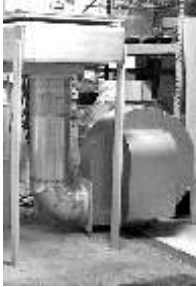
This large blower is adequate for 50 ranks or more. A much smaller version is used for organs up to 20 ranks.