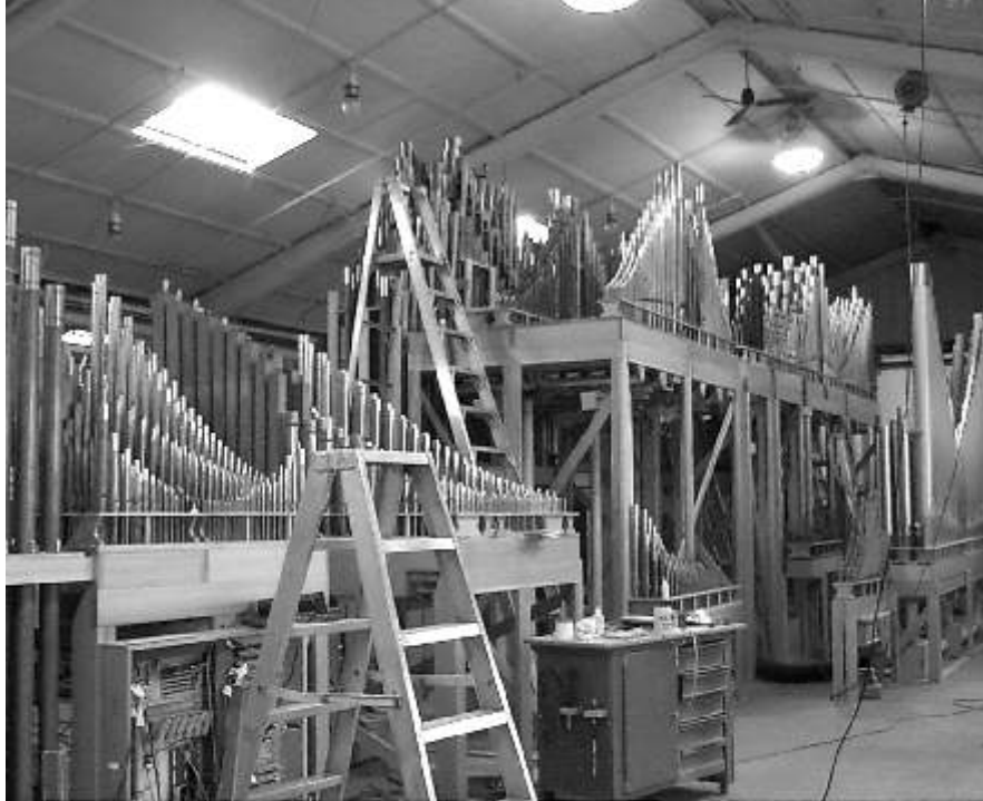
An organ set up for testing at the Wicks Erecting Room. All parts are arranged as they will be in the final installation.

An organ, by definition, is a wind-blown musical instrument which produces its tones from pipes made of either metal or wood. Pipes are blown in response to commands from a keyboard. The organ has proven to be the instrument best suited for accompanying congregational and choral singing. Composers of church music have recognized this, providing a vast library of organ music, and a long and successful history of using organs and organ music in churches has developed. This tradition shows no signs of abating, and organs are still essential in most churches.